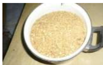
(b) Neem pulp powder