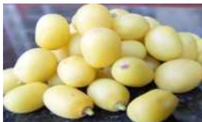
(a) Ripe and fresh fruits

Neem fruits were sorted at site collection and cleaned with water (Figure 1a). The fruits were distributed on a rectangular tray, placed on the roof to capture the maximum solar radiation for an average of 3 to 4 days. The fruits are returned from time to time to accelerate and harmonize the drying the time (Figure 1b). Once this drying is complete, each fruit placed in the horizontal position is cut in half with a knife (Stainless Steel, China) and the kernel is removed. The pulp obtained was exposed to the sun for 6-8 days on average and the end of drying is observed when the pulps are firm at the finger pressure.