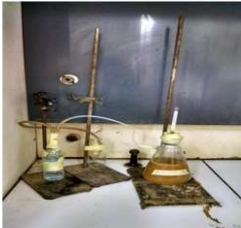
Figure 3: Dispositif de fermentation alcoolique (Labo ENSAI, Juin 2017)

The fermentation was monitored by taking ten mL with a syringe every 24 hours and for 120 hours. The controlled parameters are: the pH, the temperature and the density of the fermentation must.