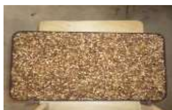
(a) Dried neem pulp

The obtained pulps were ground with a wooden mortar until the powder is obtained and the resulted powder was sieved using a sieve of mesh equal to 500 \mu\text{m} , the fine powder obtained was sent to the laboratory.