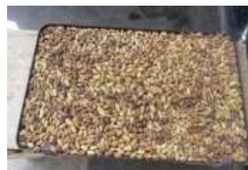
(b) Dried fruits